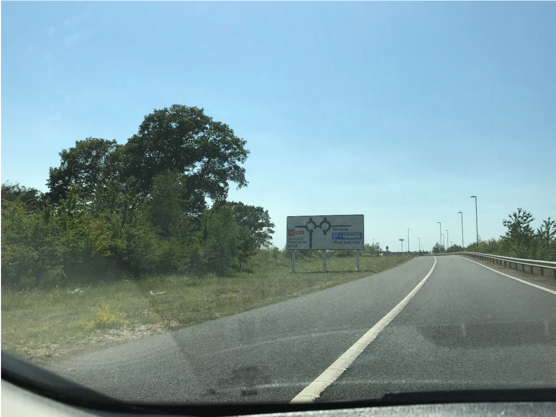
REJOINING A120 SOUTHBOUND SLIP FROM SUBJECT PROPERTY